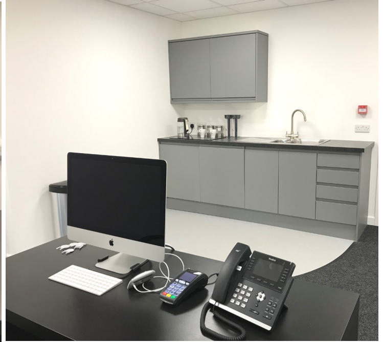
Reception and kitchen