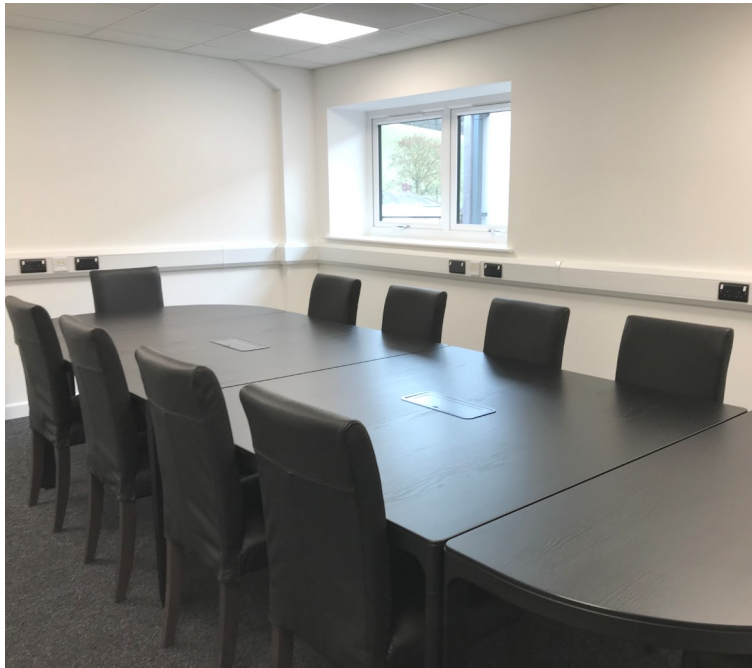
Shared meeting room